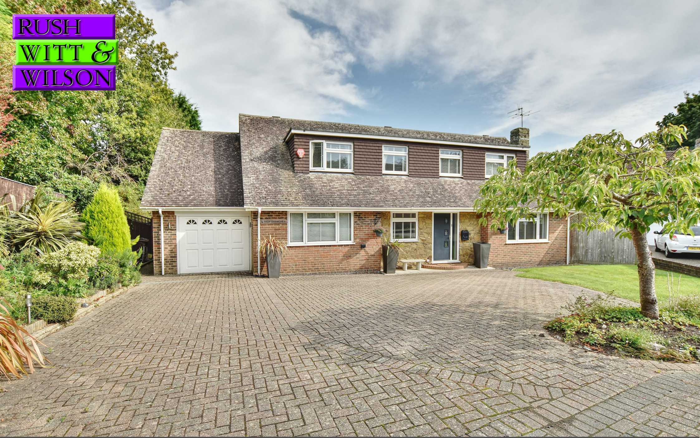
4 High Branches Collington Rise, Bexhill-On-Sea, East Sussex TN39 3RS £799,000